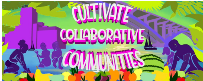
The final design concept. See it now on the East Lake Street side of our building!